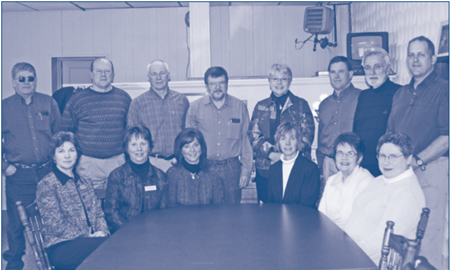
The Virginia Community Foundation invited representatives from local arts organizations to the Foundation office to announce the new Fund for the Arts.

If you have questions, please contact the Foundation at 749-8239 or by e-mail to director@virginiafoundation.com